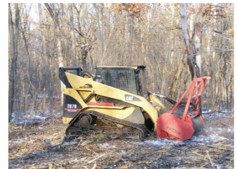
Forestry Fecon mower