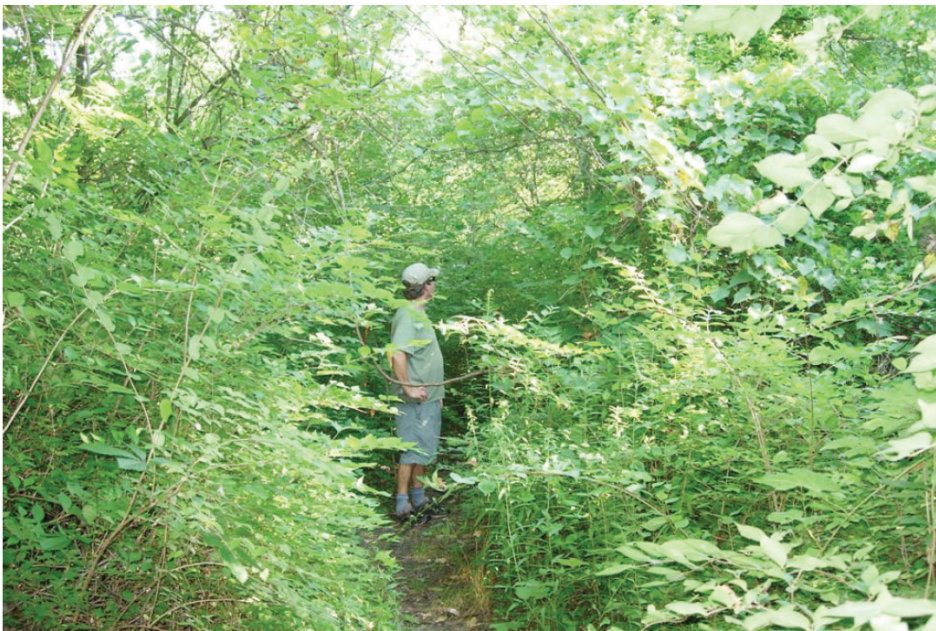
Bush Honeysuckle dominating the understory of the forest