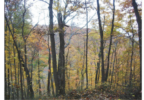
Steep topography of Brock Sampson

Tree of Heaven ( Ailanthus altissima ) had invaded high quality mesic and upland forest communities at Brock Sampson Nature Preserve. There were many large colonies of 40-50 trees 2-3 feet in diameter. Eco Logic performed a basal bark application with an oil based herbicide during the late fall of 2007. One of the biggest challenges of the project was to locate, treat and re-visit the various clones and individual trees. Eco Logic relied heavily on GPS units and GIS mapping to streamline the applicators time in the field. A follow up treatment on the project was performed in the spring of 2008 to exterminate any Tree of Heaven that were not completely eradicated during the first phase of the project.